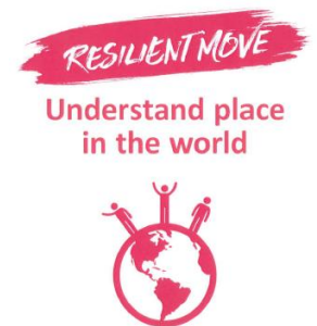
One of the 42 'Resilience Pathway' flag stone designs

The aim is to create a walking route depicting resilient moves and the machine etched stone flags are being installed by Sisk within the paving scheme as part of the Blackpool Tramway extension.