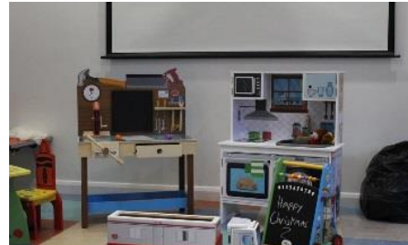
Wooden Toys made at Sisk's Training Academy and donated to Aspired Futures

The project has encouraged employees and supply partners to take part in Blackpool's volunteer scheme