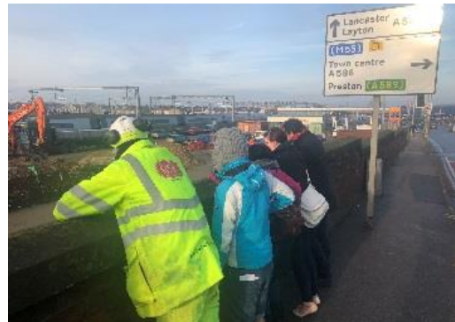
Young People from Streetlife on a site visit with Sisk

Streetlife provide a number of services for young homeless people including an emergency shelter, drop-in sessions and life skills sessions.